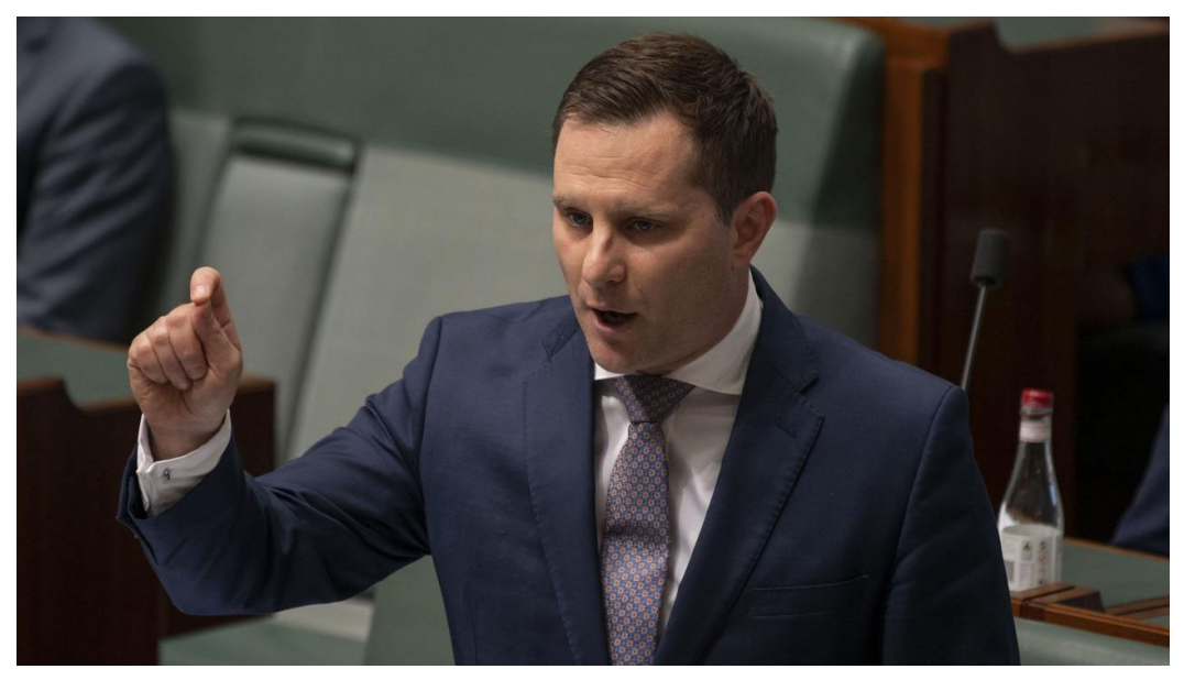
Alex Hawke MP during Question Time at Parliament House in Canberra.

Mr Hawke's comments on Wednesday came just a day before Labor acted to shut down consideration of the Morrison government's proposed legislation to strengthen character test provisions for migrants, making it easier to boot out foreign criminals.